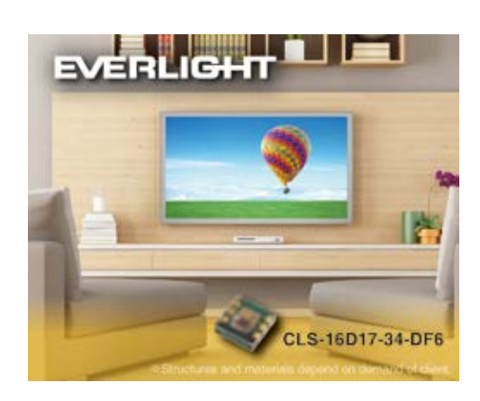
Image caption: EVERLIGHT's new digital RGB color sensor CLS-16D17-34-DF6.